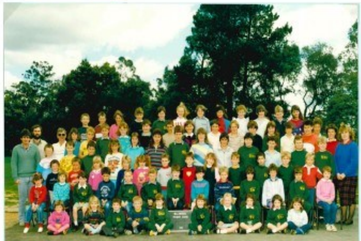
1987 Whole School