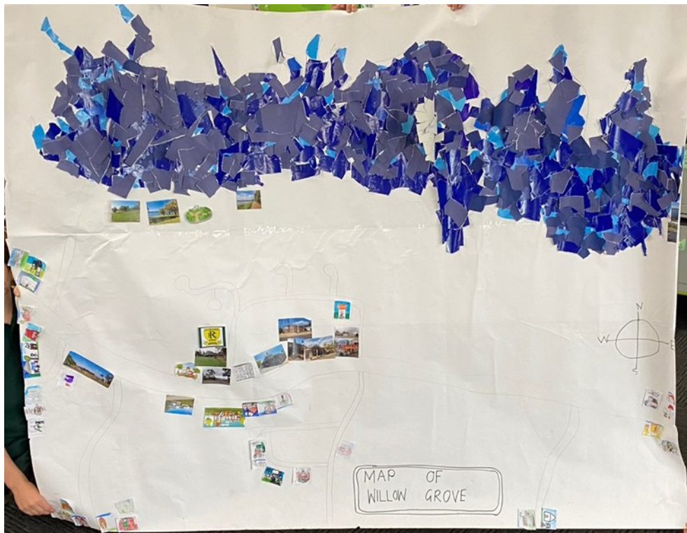
Our map of Willow Grove

Over the last couple of weeks, we have been working on our mapping skills. In our inquiry unit we have made a map of Willow Grove. We have included important places on the map, including Blue Rock Dam, the School, Kinder, the Cenotaph, Sports ground, Fire station, cemetery, The Irish and Willow on Main. We learnt about compass roses and also added this to our map. We now know which way is north. Another feature of our maps was adding our own house. If we lived off the map, we put our house on the road closest to it. As well as creating a giant class map, we also made our own smaller versions. On Monday, we drew a map of the school and wrote instructions for a buddy to get to the sandpit from our classroom. We added a map key to this map. We then tested our instructions. We read our instructions to our buddies and adjusted as needed. Sometimes our instructions made our buddies crash into a wall or gate (oops!).