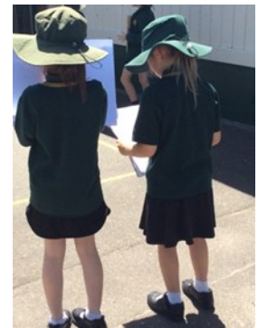
Giving directions to the sandpit.