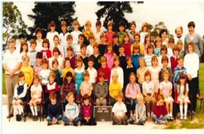
1985 Whole School