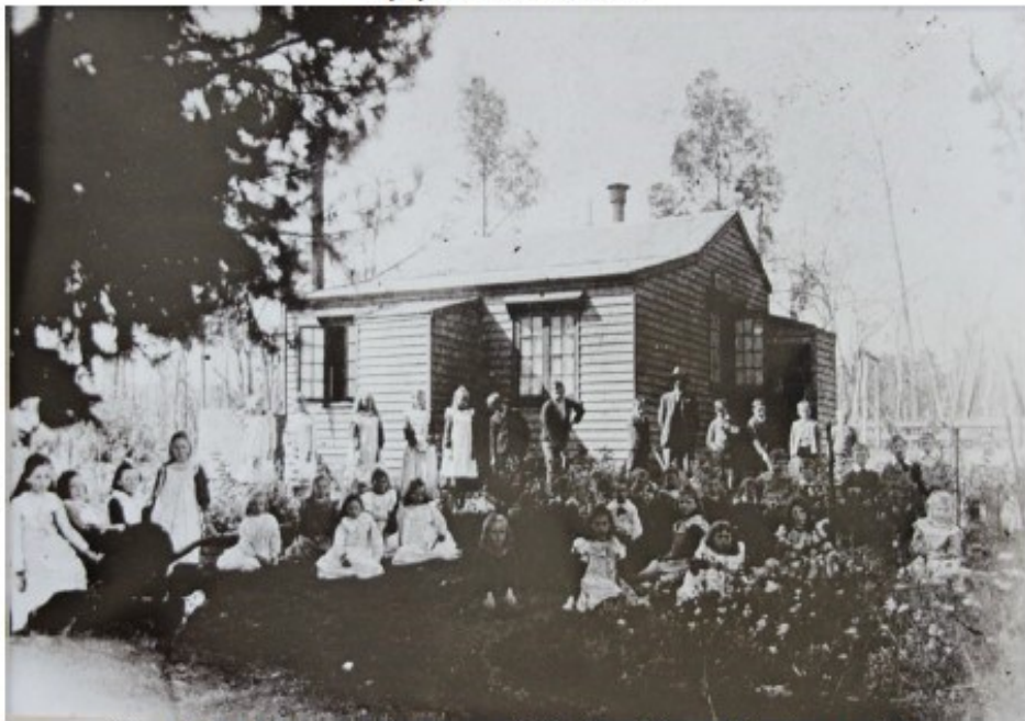
Lalorbe River State School (now known as Willow Grove Primary School) in the 1880s.

Throughout the day the Prep, One, Two will participate in a number of fun activities.