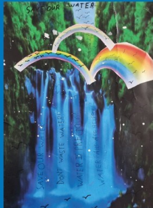
Ahliana's winning poster from 2022