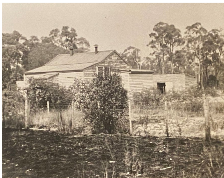
The school on the new site.